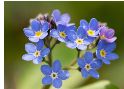
Alpine Forget- Me-Not