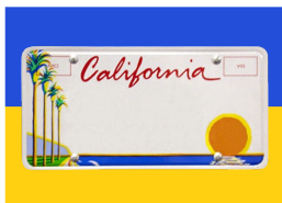
Blue & Gold