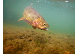
Greenback Cutthroat Trout