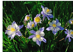
Rocky Mountain Columbine