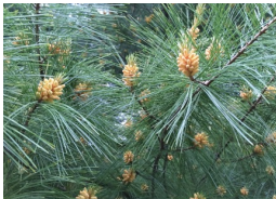
Western White Pine