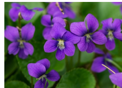
Common Blue Violet