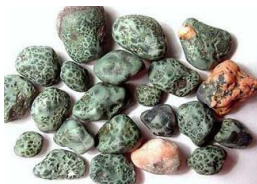
Isle Royale Greenstone