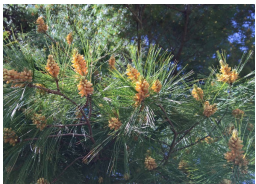
Eastern White Pine