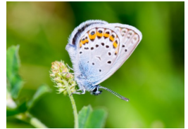
Karner Blue Butterfly