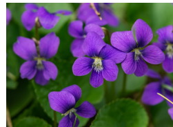
Common Blue Violet