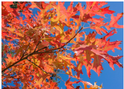
Northern Red Oak