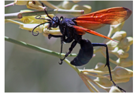
Tarantula Hawk Wasp