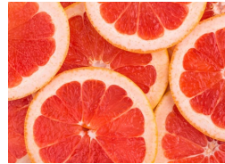
Texas Red Grapefruit