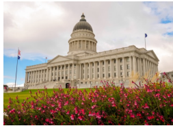
Salt Lake City